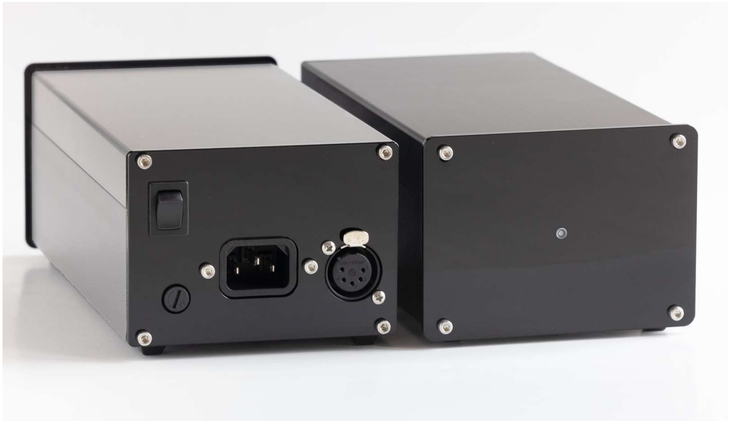
Above picture shown is for illustration only, the product contains 4 pole XLR output connector.